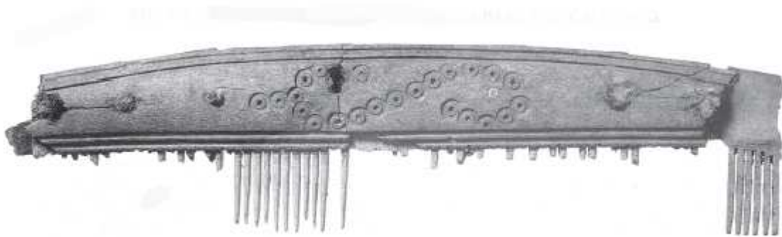
ILLUS 3 Viking comb from Brough of Birsay , Orkney (after Ritchie 1993). The length of the fragment is c 170mm

A systematic survey of Scandinavian sites of the Viking Age and Medieval period in Unst, conducted by the author during the 1990s, brought the number of settlement sites up to more than thirty on this island alone (Stummann Hansen 2000). Two sites were trial excavated, and large-scale excavations were initiated at the sites of Setters in the southwest of the island, and at Soterberg near Haroldswick on the east coast (Stummann Hansen 2000: 90–4). The site Clugan on the east coast should also be mentioned where a small amateur excavation was conducted in 1971 (Beveridge 1972). None of these sites produced organic materials. A recent excavation of a Viking settlement at Norwick produced no organic objects (Ballin Smith 2007).