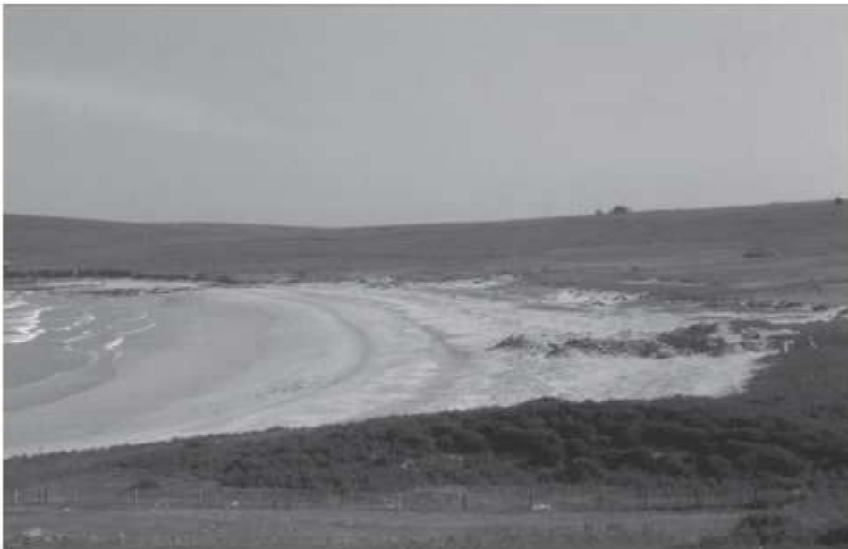
ILLUS 4 The sandy Sandwick beach at the east coast of Unst seen from the north.

Mr P Moar, of Lerwick, reports that remains of masonry were exposed by the storms of January 1937 at three points on the shore of Sand Wick. One site is at the extreme N. end of the bay, the second being 80 yds. and the third 250 yds. S. of it. At the northernmost site quantities of burned broken stones were observed and some fragments of steatite urns were picked up. At the central site are five perforated 'tether-stones'; and here were also found two bone combs of Viking type, one of which is now in the National Museum. The southernmost site, too, yielded burned stones and steatite fragments, as well as another Viking comb which, like the second comb from the central site, has passed into private collections. At all three sites the structural remains are very scanty (RCAHMS 1946, 169–170).